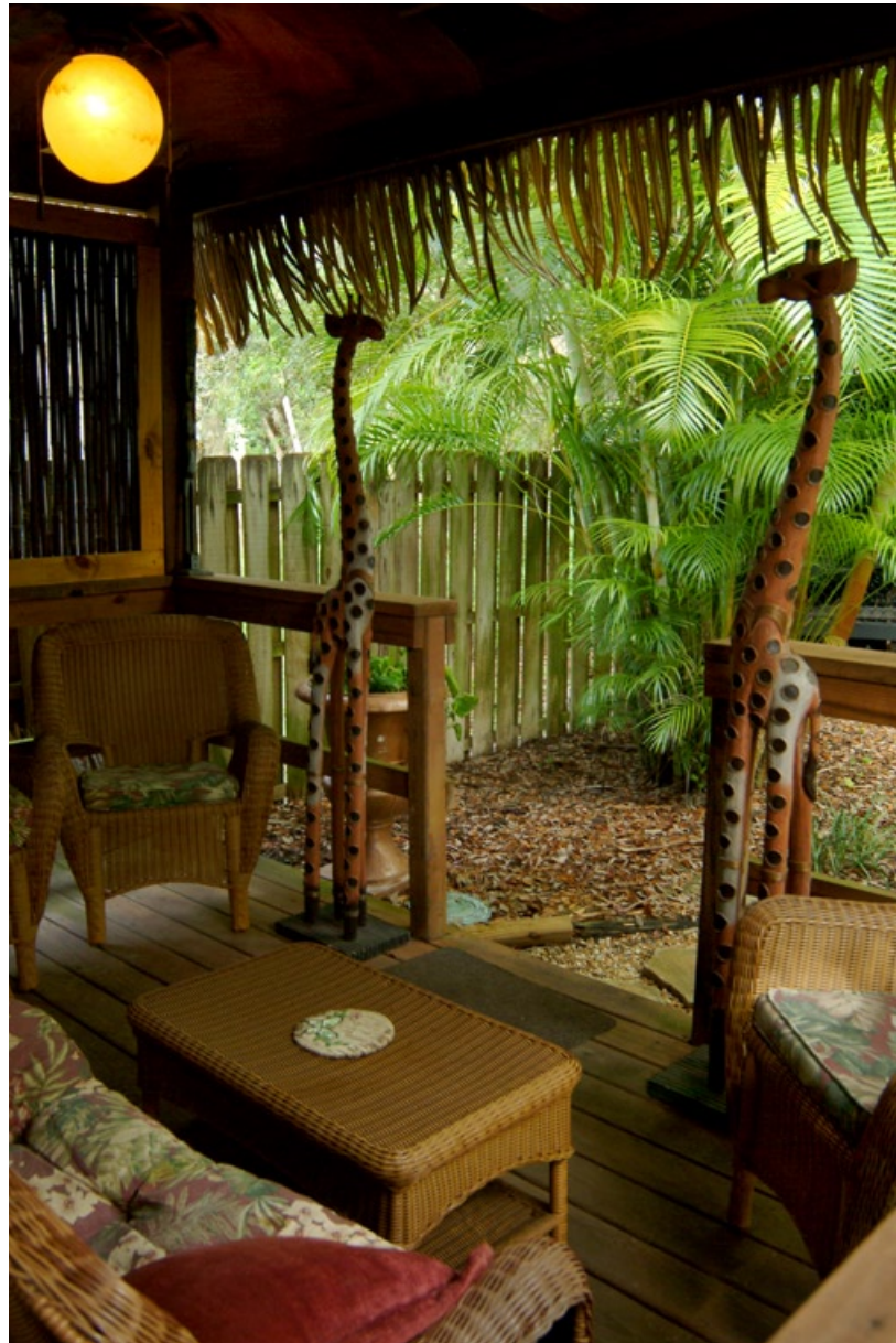
Cabana House 1

takes center stage during a party with its festive tiki bar and a fireplace surrounded by palm trees and an attractive brown wicker couch with matching chairs.