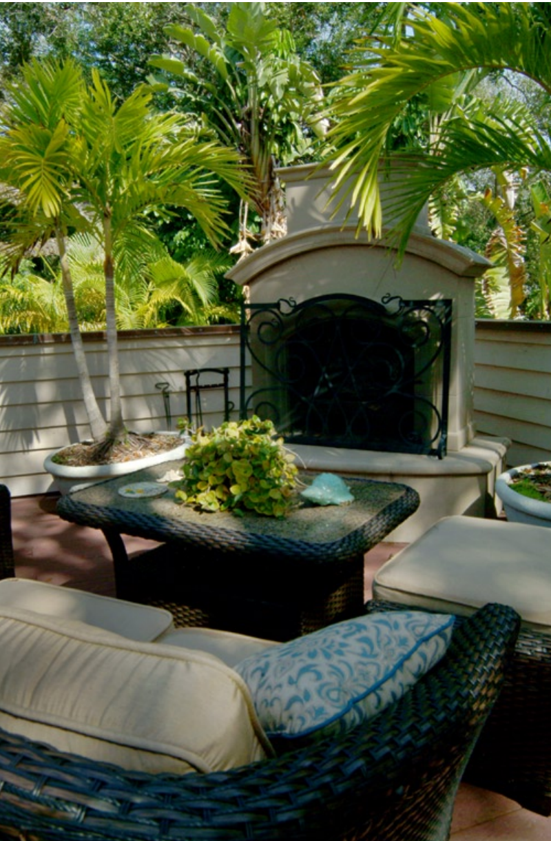
deck outdoor living room

like an extension of the house. The garden is replete with plants and shrubbery, all native to Florida or well able to adapt to its climate. "I won't have any that require special pampering because I refuse to fertilize or use pesticides," said Laura, who does all of the landscaping. "I find gardening meditative and I enjoy going out there."