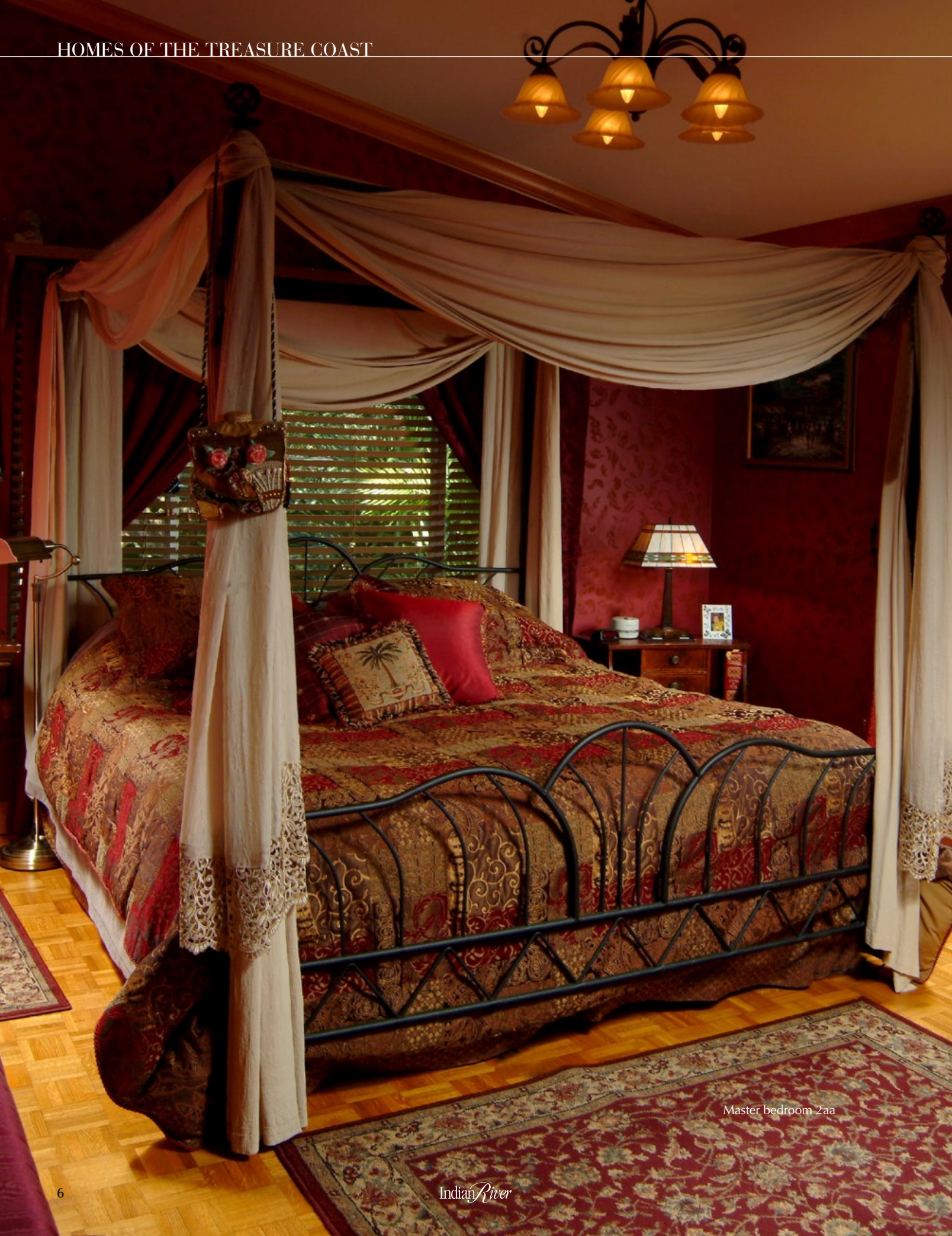
Master bedroom 2aa