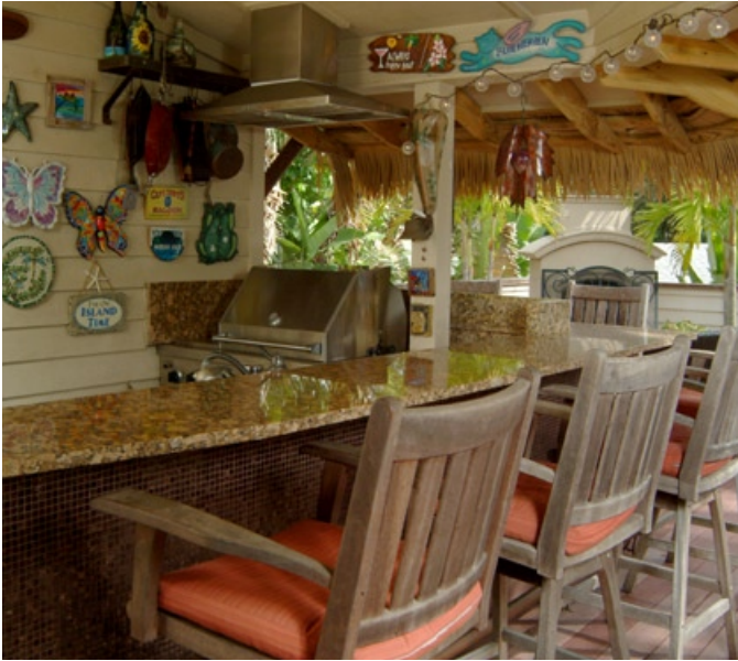
Bar above, pool and mural, right.