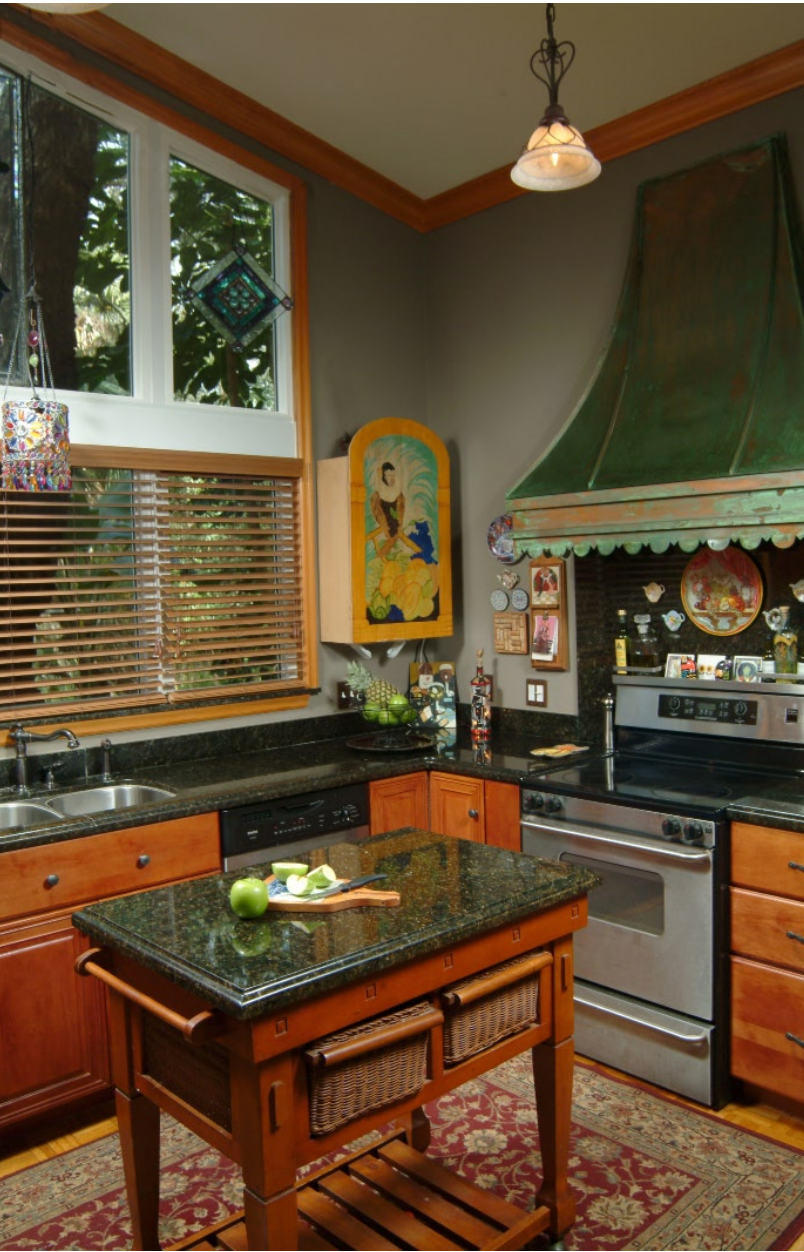
Kitchen 2a and Pool, right.